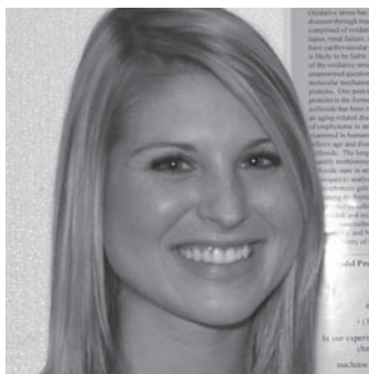
Shannon Mumma Jacob Sacks Scholarship