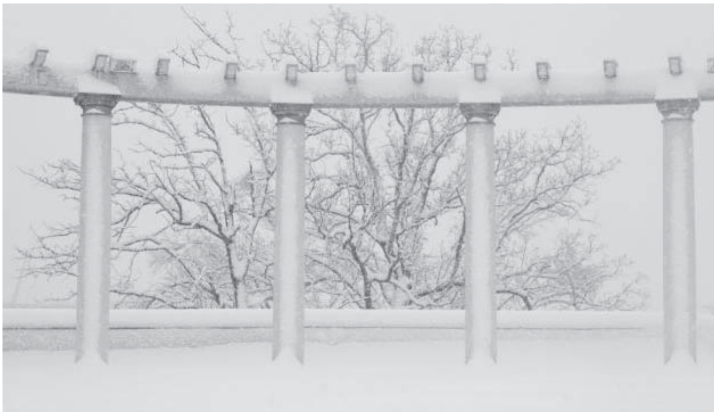
Photo of the Chi Omega Greek Theatre in the snow by Denise Greathouse.