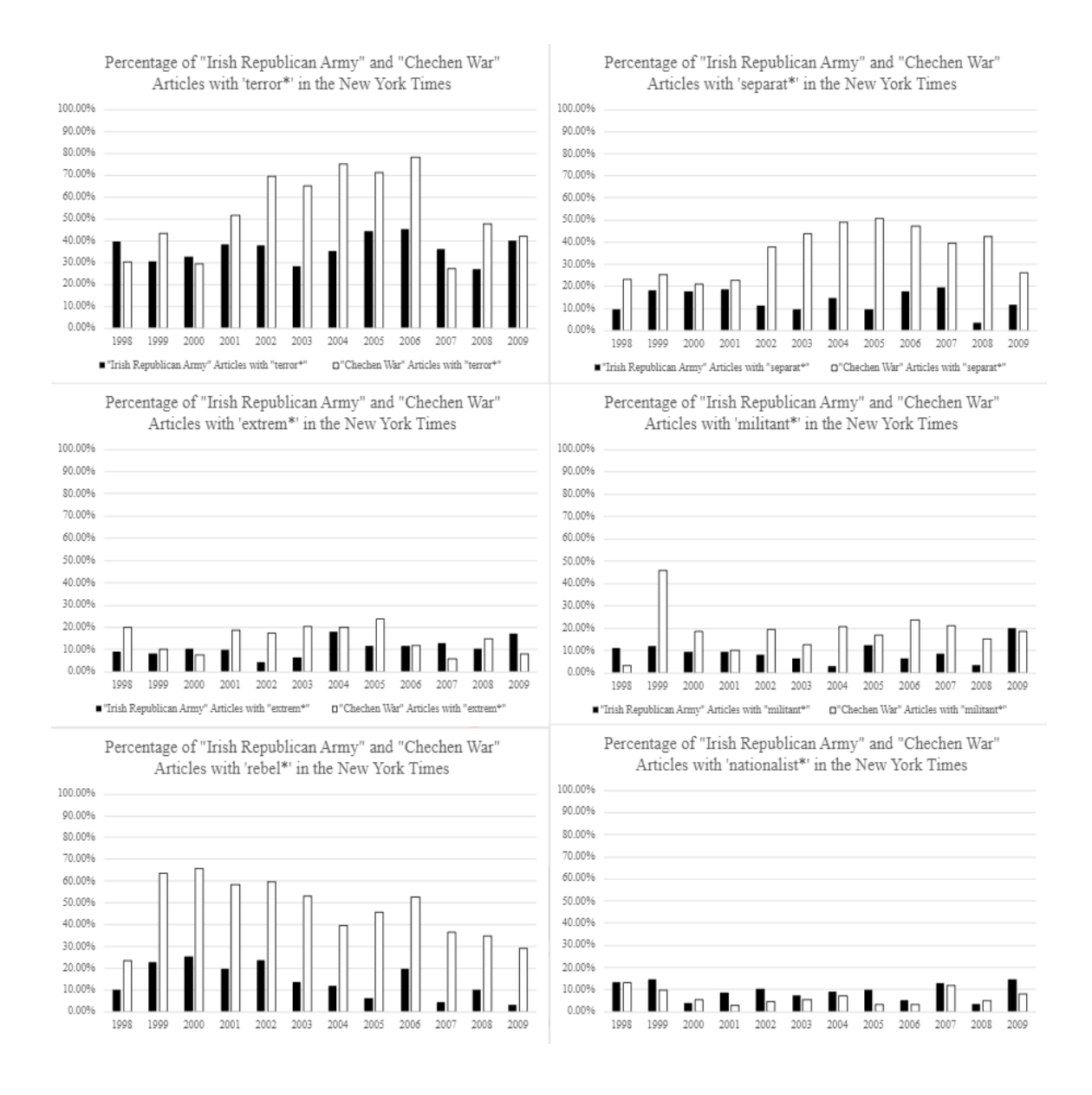
Figure 1: Percentage stacked column charts showing the change in percent usage of certain words in "Chechen War" and "Irish Republican Army" articles published by the New York Times between 1998 and 2009.

Regarding usage of the word 'terrorist' in articles that mention "Irish Republican Army," the percentages range from 26.67% in 2008 to 45.16% in 2006, with an average percent of 33.91%. While there were some increases and decreases, they were not significant enough to display any discernable histogram pattern. In contrast, there are some significant results