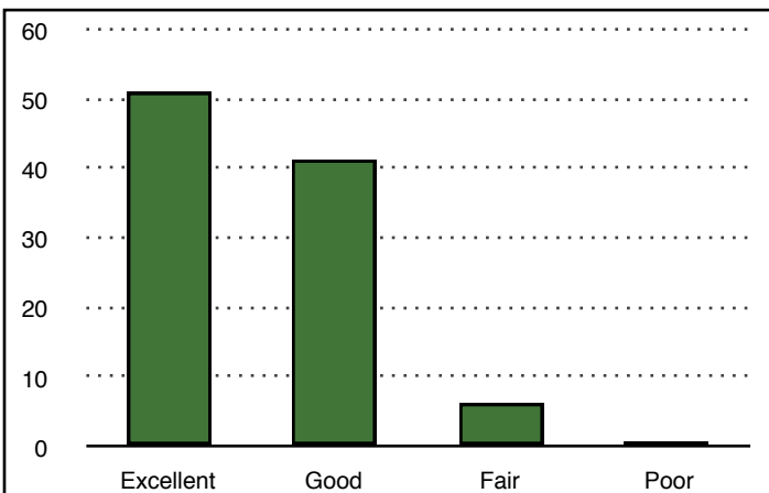
Figure 1.1 Residents' Ratings: Quality of Life Northwest Arkansas, 2008