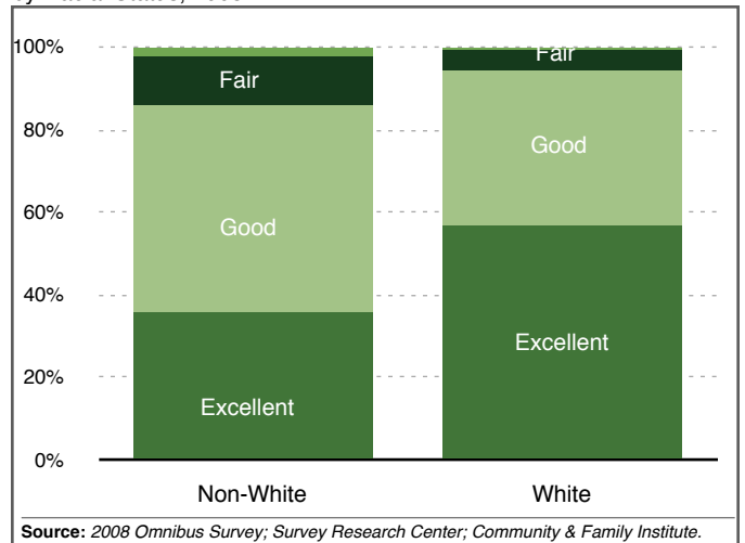
Figure 1.5 Residents' Ratings: Quality of Life in Northwest Arkansas by Earnings Status, 2008